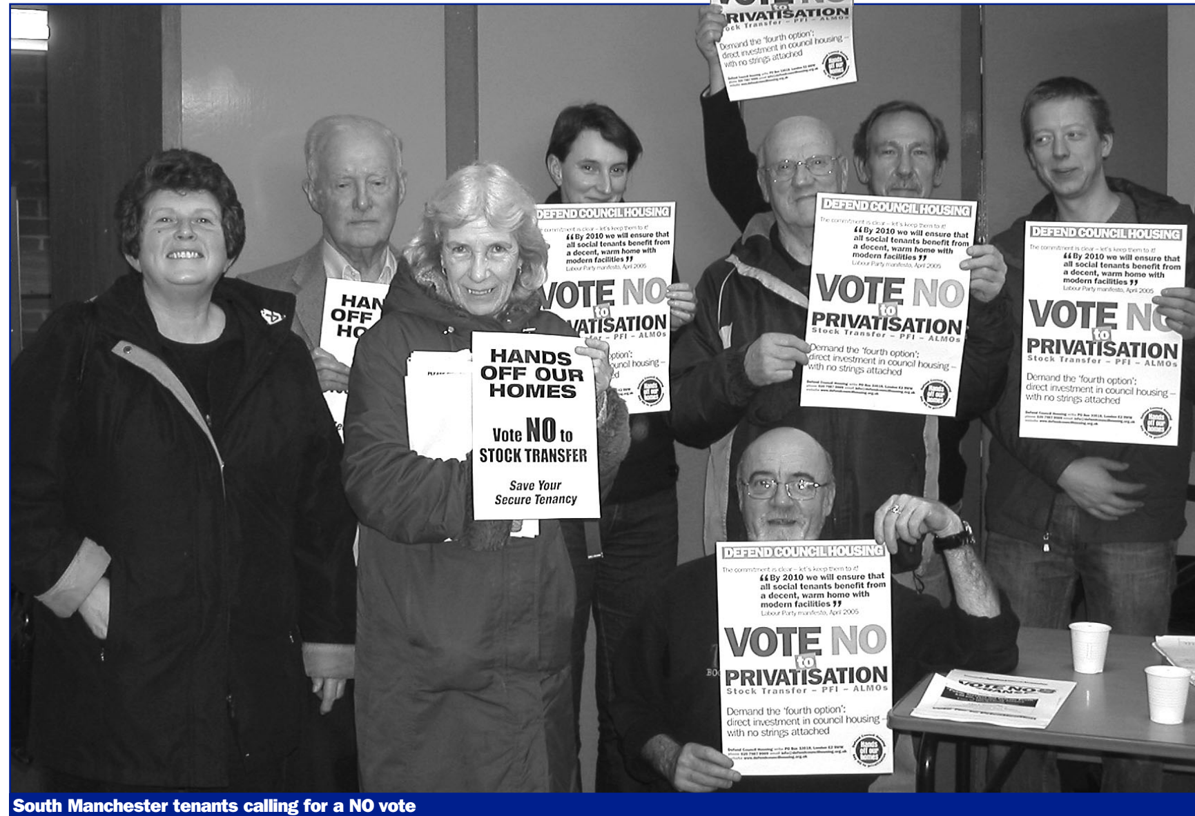
South Manchester tenants calling for a NO vote

ference has taken on the issue of social housing in 2004 and 2005... We believe that bringing all social housing up to decent standards is central to Labour's Sustainable Communities agenda... In particular the group is exploring ways of creating a level playing field in the funding for social housing, between those with ALMOs or Housing Associations, and those without... we await its conclusions early next year”